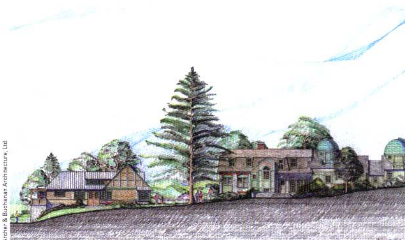
Archer & Buchanan Architecture, Ltd.

In order to further its mission "for the encouragement of horticulture in its broadest sense" and to facilitate the task of maintaining Swarthmore College's reputation of having "the most beautiful college campus in America," The Scott Arboretum has determined that they are in critical need of a new facility. The existing 900-square-foot greenhouse will be replaced with a new 5,400-square-foot greenhouse and education center. The new facility will house a 1,800-square-foot production greenhouse, a 565-square-foot workroom and a 625-square-foot multipurpose room to support the arboretum's growing public programs. The building, located near one of the college's main entrances, is sited adjacent to the picturesque Victorian-styled Cunningham House (the Arboretum's headquarters) in a prominent and scenic landscaped environment.